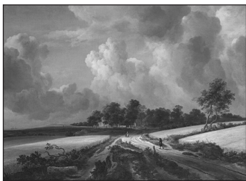
Jacob van Ruisdael (1628/29 –1682) Wheat Fields, c.1670 Oil on canvas, 39 3/8 x 51 1/4 in. The Metropolitan Museum of Art, New York. Bequest of Benjamin Altman, 1913

The Metropolitan Museum is home to the finest collection of Dutch art outside of Europe. 228 masterpieces are displayed together for the first time in The Age of Rembrandt: Dutch Paintings in The Metropolitan Museum of Art . The exhibition, which coincides with the publication of the first catalogue of the collection, celebrates