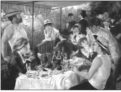
Pierre-Auguste Renoir (1841–1919) Luncheon of the Boating Party , 1880–81 Oil on Canvas, 51 1/4 x 69 1/8 in. Acquired 1923. The Phillips Collection, Washington, D.C.

After breakfast on Saturday (included), we visit The Phillips Collection , where, among other treasures, we'll view Renoir's masterful Luncheon of the Boating Party . There will be time for a mid-morning snack at the gallery before we set off for Wilmington.